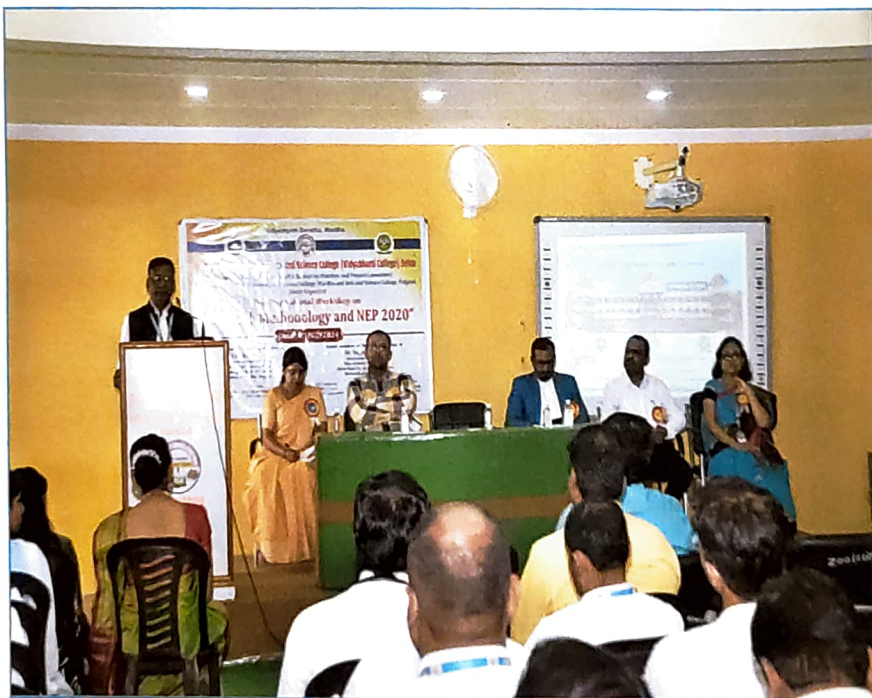
Inauguration of Workshop