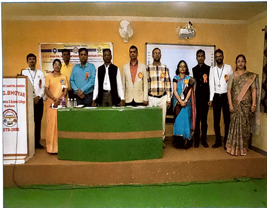
Valedictory Function of Workshop