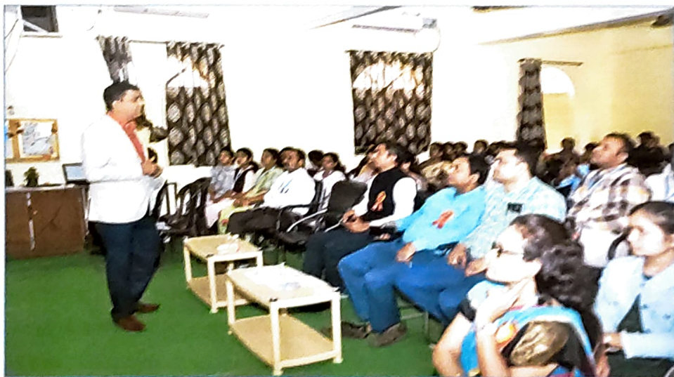
Session II of Workshop