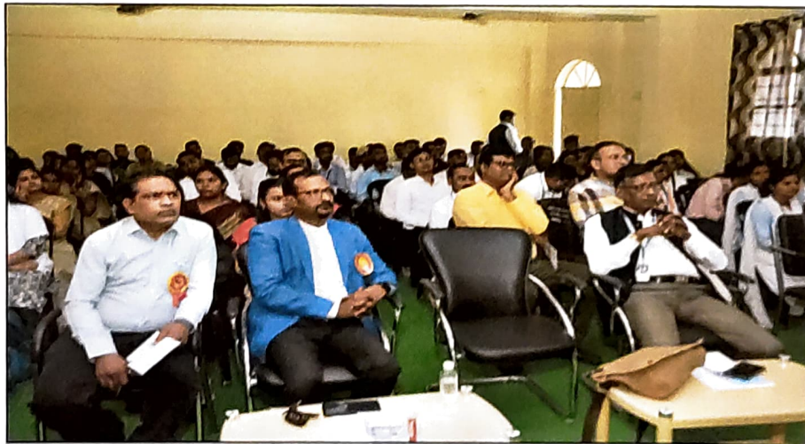
Session I of Workshop